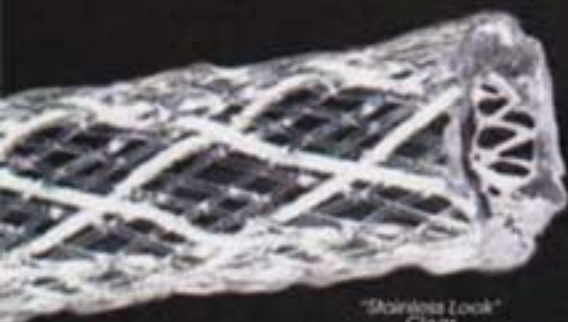
"Stainless Look" Clear