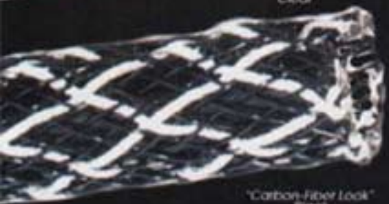
"Carbon-Fiber Look" Black