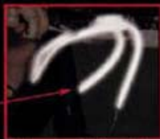
Enlargement detailing the front brake cables

By the Case $11.60 per pkg (12 packages per case)