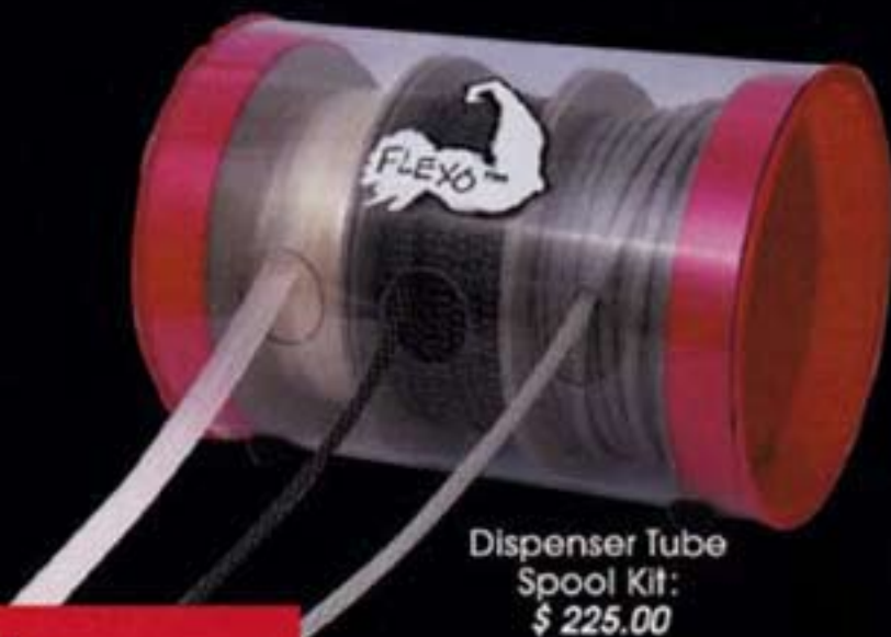
Dispenser Tube Spool Kit: $ 225.00