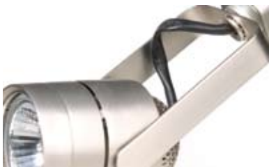
High temperature fiberglass base material makes Flex Glass a great solution for demanding lighting applications.

Acrylic Flex Glass is used in applications such as relays, radio circuits, transformers, and lead/crossover protection on motors. Highly resistant to acids and solvents, and will withstand tough assembly handling. AG sleeving is recommended for thermal requirements from -94°F to 311°F ranges.