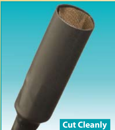
Cut Cleanly Scissor