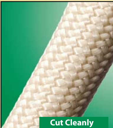
Cut Cleanly Kevlar Shears